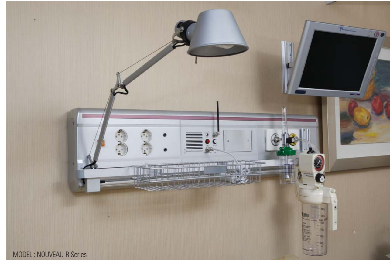
MODEL : NOUVEAU-R Series

Whatever your requirements-ward, Recovery CCU, ICU, NICU-Nouveau R series Bed Head Unit is designed to meet each area's necessity, with the required level of service. You specify the needs of the care deliver and the location of services and medical equipment.