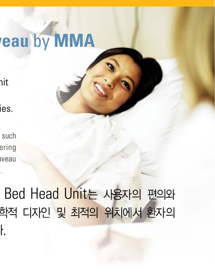
MODEL : NOUVEAU-G Series

MMA의 Nouveau Series 2009 Bed Head Unit는 사용자의 편의와 실용성을 위주로 제작되었으며 인체공학적 디자인 및 최적의 위치에서 환자의 편안함을 얻을수 있도록 제작되었습니다.